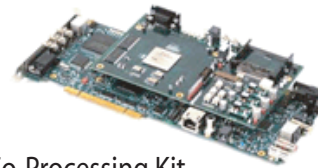
Video Co-Processing Kit