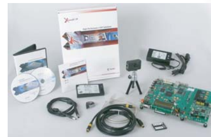
Spartan-3A DSP Video Starter Kit