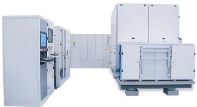
Beam Steering Controller