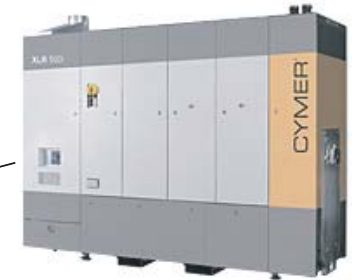
Power Amplifier Controller Wavelength Controller