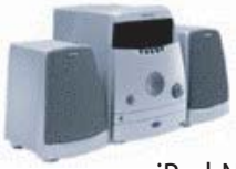
iRad-N MP3 Player